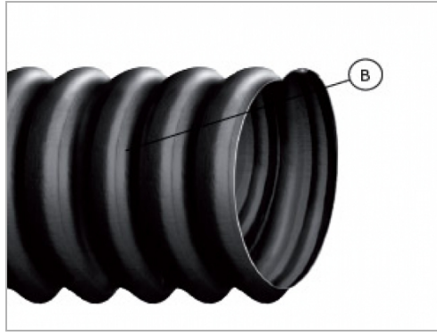
Santoprene® coated polyester fabric

Contact our offices for not listed sizes